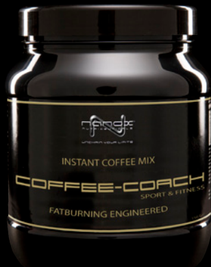
COFFEE-COACH – jar of 150 gram NUT/PL/AS/1363/8